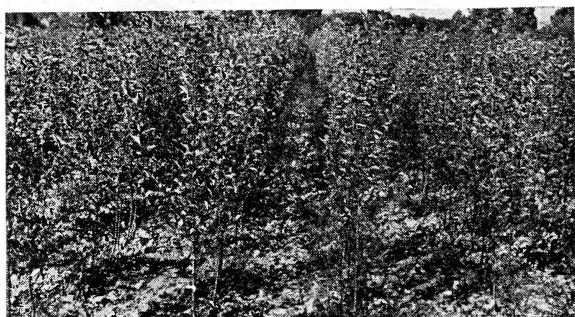
(Block of 2 yr. Apples)